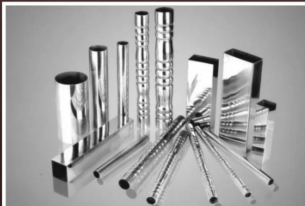
Stainless steel-pipes & railings