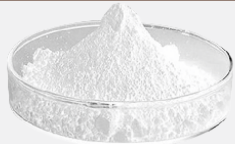
Chalk clay (cleaning powder)