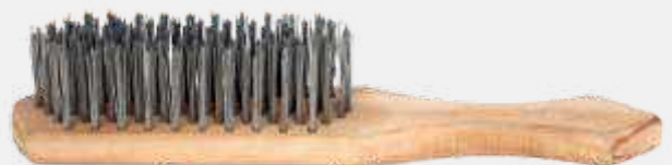
Wooden iron brush