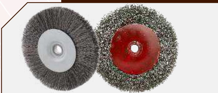
Iron buff/taar buff/steel wire buff